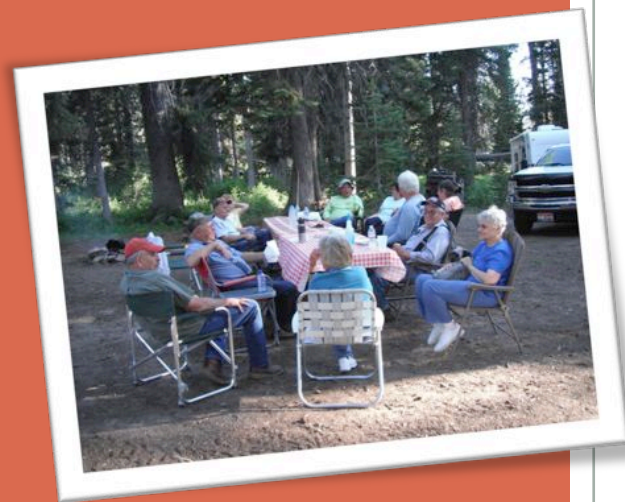
The camp where the group stayed....and ate!