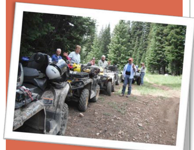
A group photo from the trail at Soda Springs.

A special thanks to all to attended and had a great time.