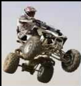
What my friends think I do.