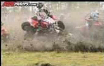
What media thinks I do.