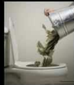
What I actually do.