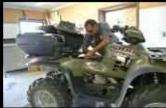
What my girlfriend thinks I do.