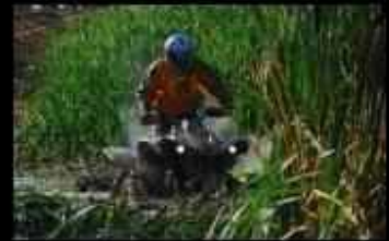
What environmentalists think I do.