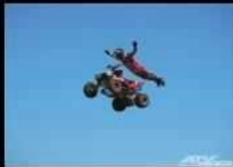
What I think I do.