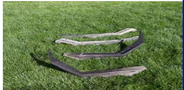
Take-Off Plastic Fender flares Front and Rear for Maverick X Can-Am Sale for $70.00

Above items are available by calling Randy at 731-4872