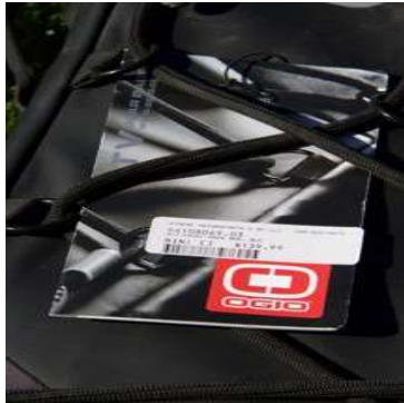
OGIO Front ATV Bag with two water Bottle holders, fold out map sleeve and Bungee strap system on top. New 139.99$ sale for $65.00