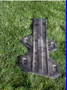
Can-Am plastic skid plate for Outlander Max sale for $20.00