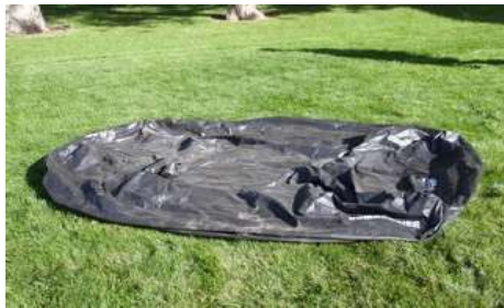
Can-Am 780 000 002 storage cover for outlander max G-2 2008-2017 New $ 154.99 sale for $70.00 ( there is no holes or tears) For two up machine