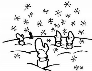
OK, Show of hands... Who's tired of snow?

Over the years we have had several members use this service and the small price you pay now, could save you a significant amount of money down the road!