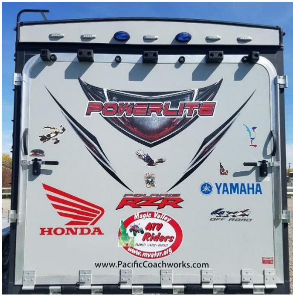
Kris Larson's trailer is ready to go camping!