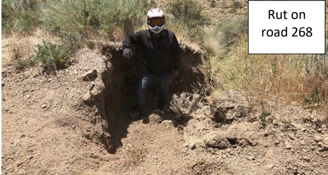
Rut on road 268