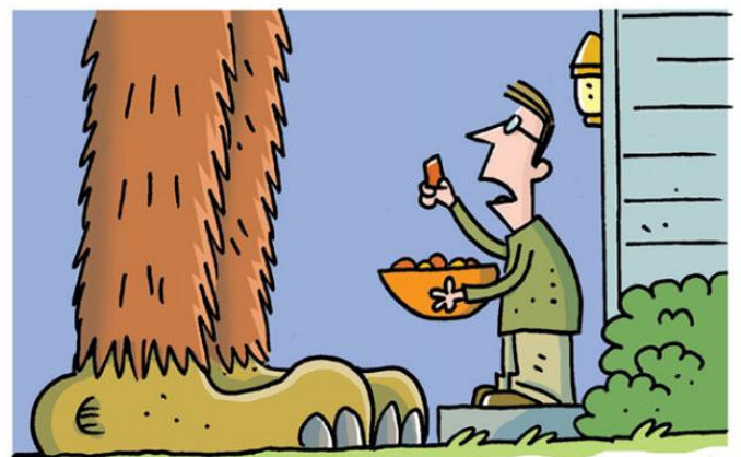
"Sorry. Bigfoot or not, only one piece of candy per trick-or-treater."

Q: What's a ghosts favorite ride at the carnival?