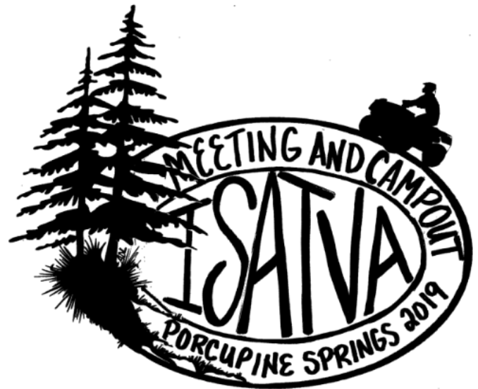
Closeup of the design