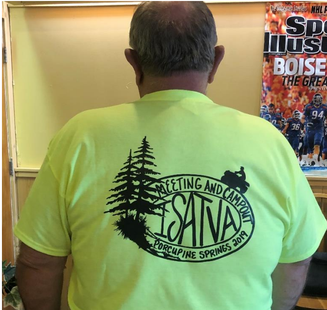
Rear of the shirt. The front will have a small club logo on the chest.