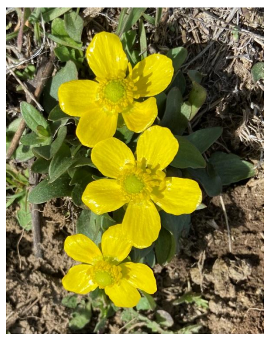
Sagebrush Buttercups RANUNCULUS GLABERRIMUS

Seen on the Minidoka Crossing Ride Saturday, March 26, 2022