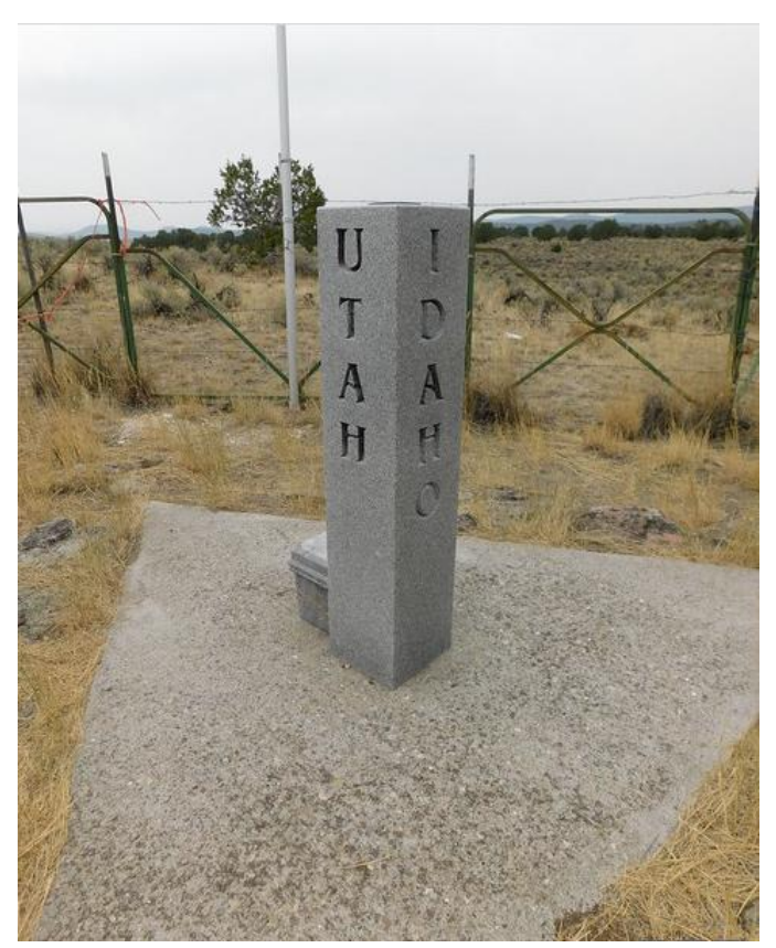
ID, NV, UT Tri-State Monument

Meeting discussion centered on the Club's cooperation with the Forest Service to address Trail Work issues. Trails discussed were Trout Creek, Swantee Springs, Kirkham, Third Fork, Trail 912 near FS Flats, possibility of connecting Trail 617 to 618 in the Wooden Shoe Butte area. In addition, barriers at Porcupine and other trailheads were discussed, along with access to Three Corners Road leading to the 3-sided ID-NV-UT Tri-State Monument twenty-five miles from Oakley, ID.