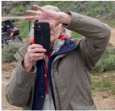
YOU'VE BEEN CAUGHT WEARING "THE HAT!"