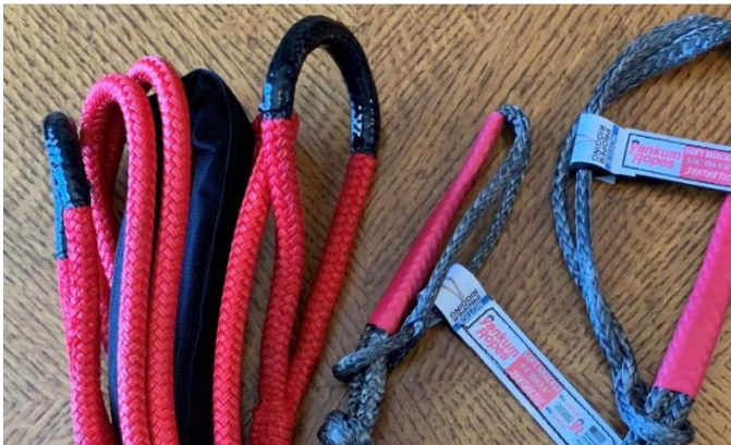
New Yankum tow rope and 2 new shackles

I used the same tow rope plus 5/16 inch shackle for the tow. Randy had a large hook on the back of his machine for attaching the tow rope. I did not need to use my 1/2 shackle this time, but feel it is nice to have 2 different size shackles depending on the situation.