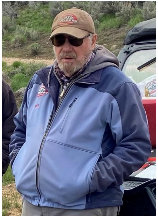
WEAR THE HAT!