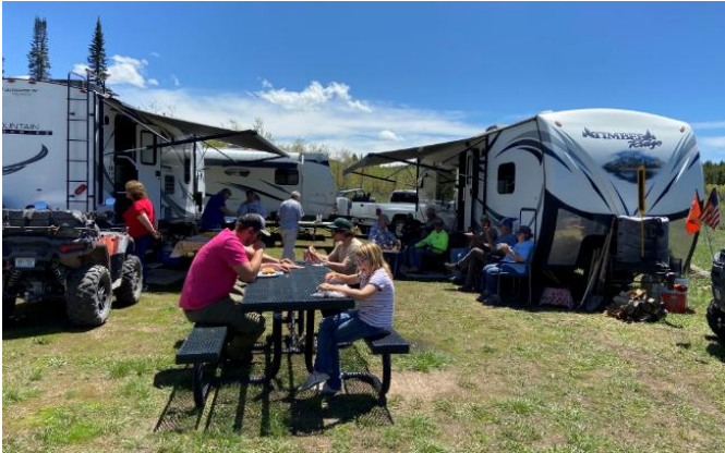
Dutch oven and Potluck