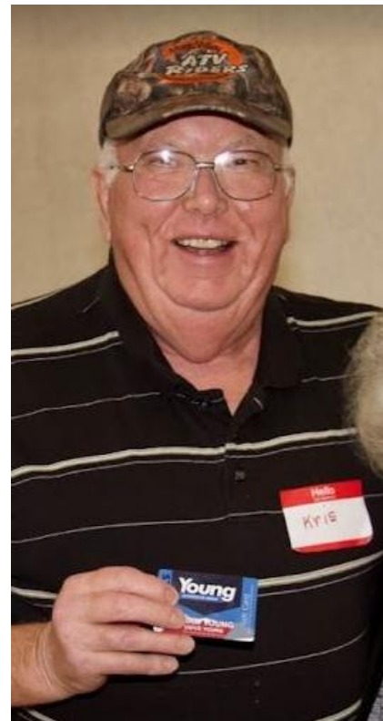
WEAR THE HAT!