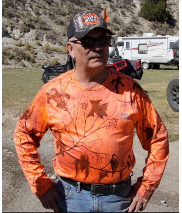
MODELING "THE HAT" May also substitute for a hunting hat!