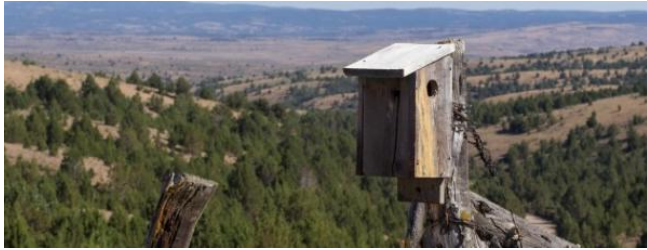
NUMEROUS BLUEBIRD NESTING BOXES WERE SEEN ON THE COTTONWOOD GUEST RANCH RIDE, JUNE 18.