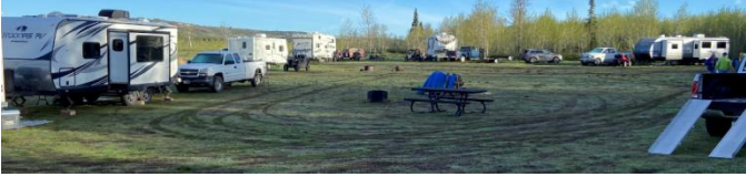
Camp & Ride