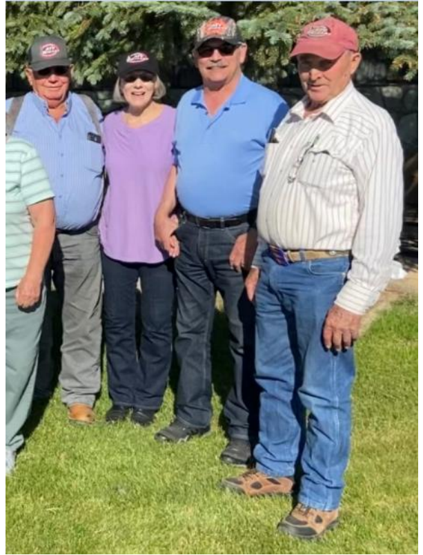
ALL "FOUR" ONE AND ONE "FOUR" ALL