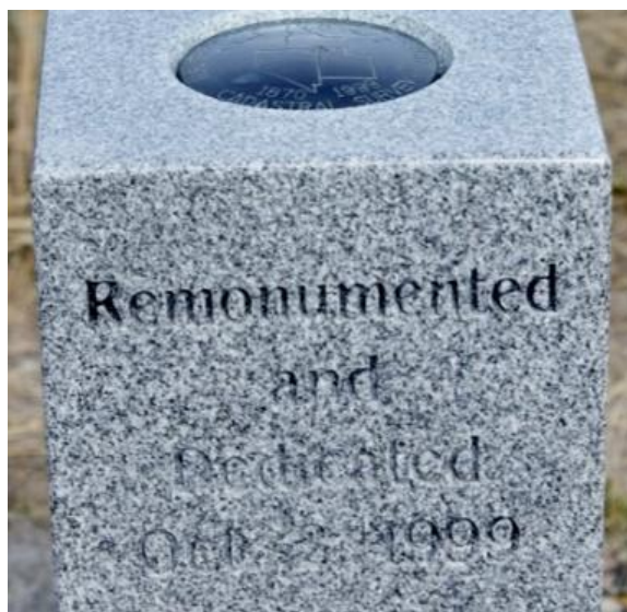
Remonumented and Dedicated October 9, 1999

The Three Corners Monument is about 25 miles southwest of Oakley, Idaho, 30 miles northwest of Grouse Creek, Utah, and 50 miles east of Jackpot, Nevada. The spot joins the Gem, Silver and Beehive states.