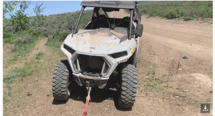
Wayne's RZR totally covered in dust

face, nose and eyes. My open faced helmet with the face shield down worked fantastic.