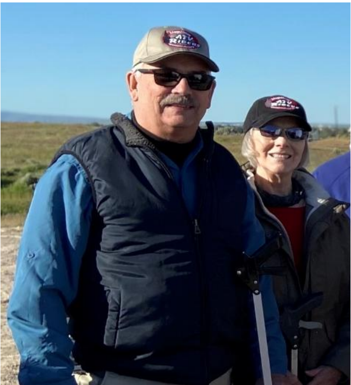
HIS AND HERS