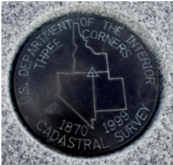
1870-1999 CADASTRAL SURVEY