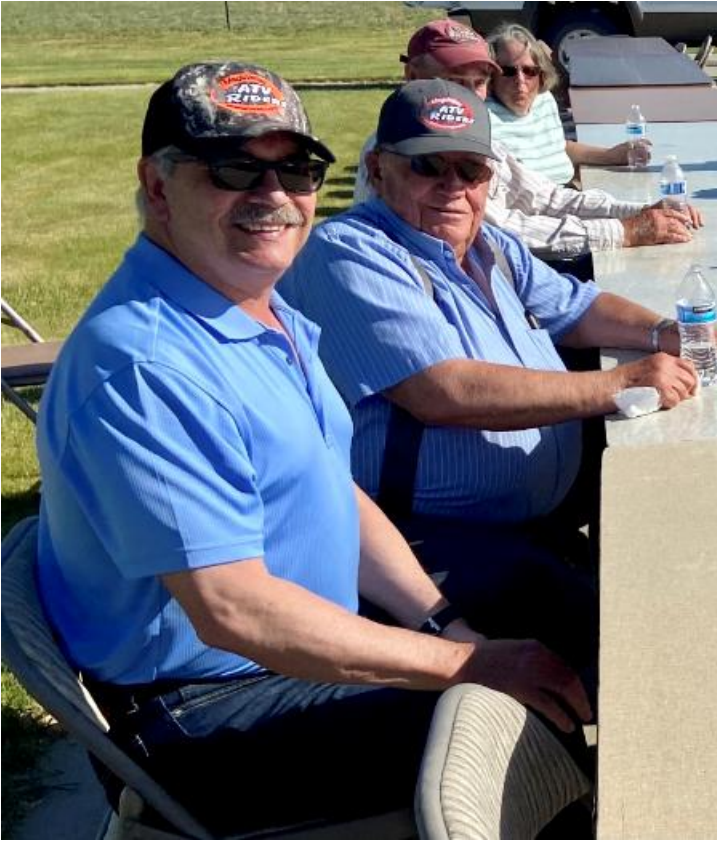
THE BLUES BROTHERS!