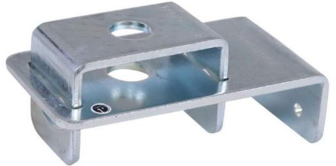
Baaer Products Propane Tank Lock Available at etrailer.com at the link above. $14.77 each