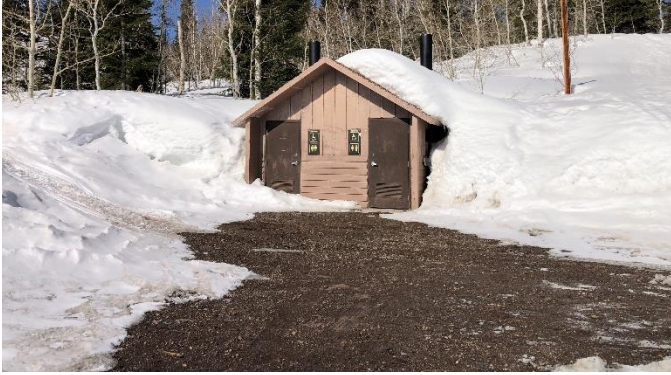
Restroom at Mt. Harrison Snowmobile parking area