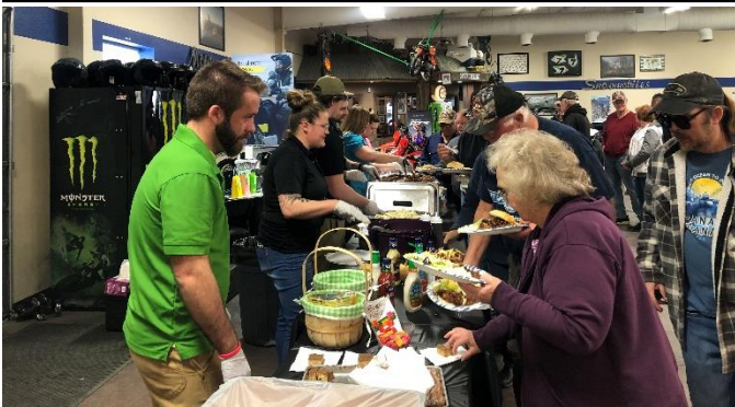
Food at Action Cycles and Sleds